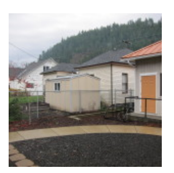
Sidewalk out back