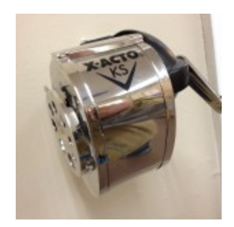
A real pencil sharpener