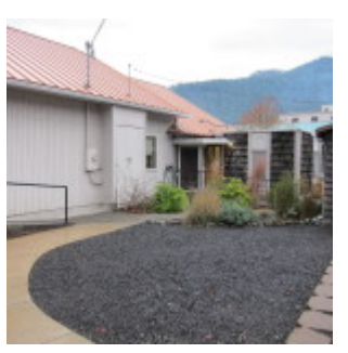
Back sidewalk and landscaping