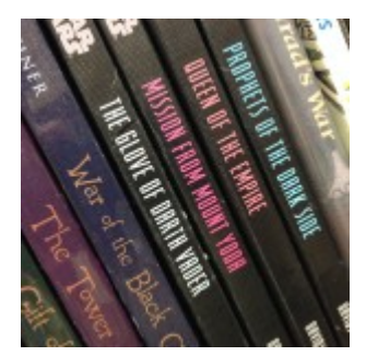
More junior fiction