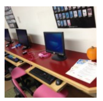
Kids computer stations