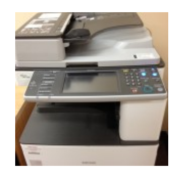
The copy machine