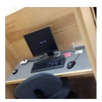
One of the three computer stations