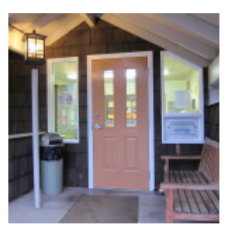
Front bench and book drop