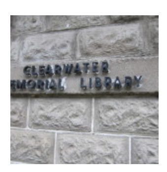
Clearwater Memorial Library building sign