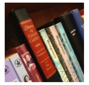
Anne of Green