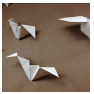
Beautiful wall display