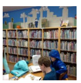
Kids reading to kids