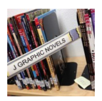
Junior graphic novels - including Star Wars!