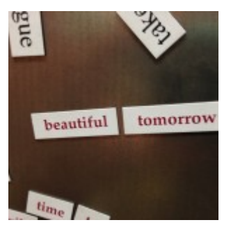
Share how you feel