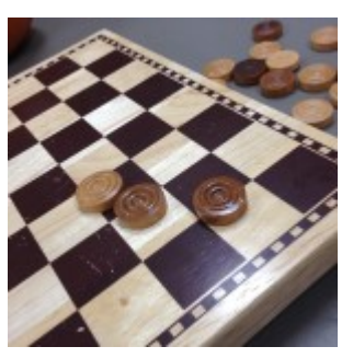
A quiet game of checkers