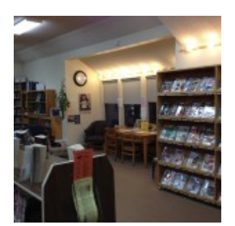
Window seat and table