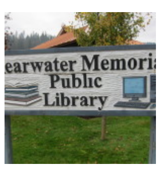
Carved wooden sign