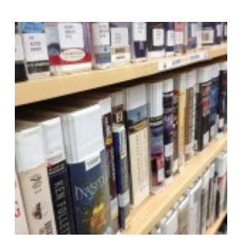
Audio book choices