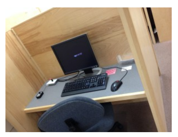
One of the library's three workstations

The library offers three computer stations and a child section of computers. Newly offered is an x-box corner! There are some cozy sitting places scattered among the books. Where can you chat on your phone? In the vestibule. The children can chat quietly and play with blocks, dinosaurs (they are library dinosaurs, they whisper *roar*), board games and puzzles in the children's section.